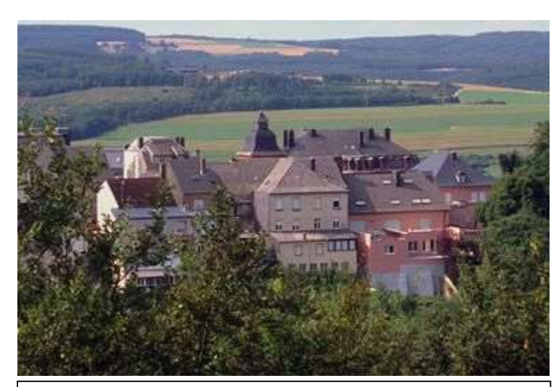
Points of view: A view of houses from the top

Generally speaking, the more senses we perceive an object through, the more knowledge we have of it. Anyone who has tried watching television with the sound turned down can appreciate this statement. Food is another good example. Our appreciation of food is greatly enhanced